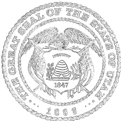
SPENCER J. COX Lieutenant Governor

IN TESTIMONY WHEREOF, I have hereunto set my hand, and affixed the Great Seal of the State of Utah this 27 th day of December, 2017 at Salt Lake City, Utah.