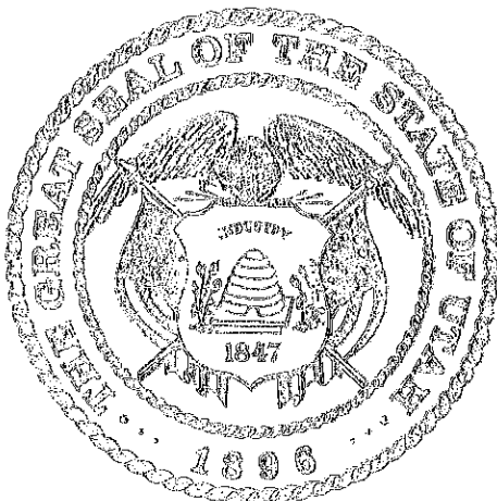
SPENCER J. COX Lieutenant Governor

IN TESTIMONY WHEREOF, I have hereunto set my hand, and affixed the Great Seal of the State of Utah this 1 st day of June, 2018 at Salt Lake City, Utah.