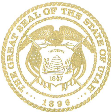
SPENCER J. COX Lieutenant Governor

IN TESTIMONY WHEREOF, I have hereunto set my hand, and affixed the Great Seal of the State of Utah this 20 th day of March 2019 at Salt Lake City, Utah.